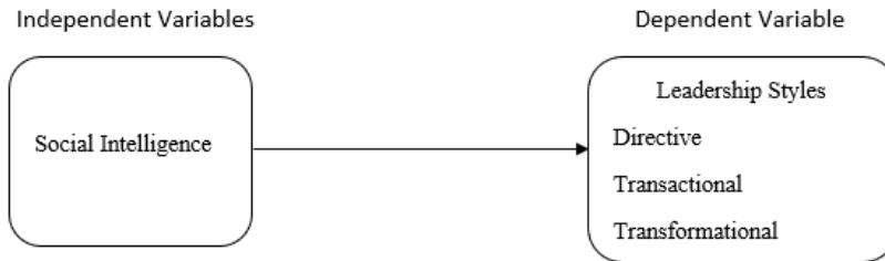
Figure 1: Conceptual Framework

Figure 1 is a self-developed framework that illustrates the detailed information regarding independent and dependent variables for the data collection and analysis techniques.